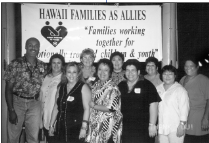
Members of the Hawaii Family as Allies

Based upon anecdotal information that we receive from families and others in the community, there remains an unwillingness by educators and other service providers to view parents as allies and equal partners in planning services for their children